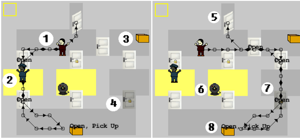
Figure 1: Locking a door causes the choice of another path, seen from the burglar’s perspective. Visible objects are: 1) the burglar, 2) a guard, 3) a closed container, 4) a closed door, marked with a darker colour to symbolize it is not fully consistent with the burglar’s belief base, 5) the level entrance, 6) a camera, that is marked with deep dark colour to symbolize that it is completely unknown to the burglar, 7) an intent line showing the future path of the burglar in the game area with arrows to mark his direction, 8) a container holding the artifact, with textual description what the burglar intends to do with it.

that the door is closed, he re-plans. The right image captures this situation, and also points out that there is another locked door on the burglar’s new path, that he is not aware of yet.